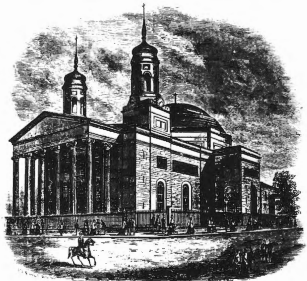
The Cathedral at Baltimore. When its cornerstone was blessed in 1806, this cathedral represented the only diocese in the U.S.

C. The bishopric of Bardstown stretches over the states of Kentucky and Tennessee,